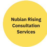
Nubian Rising Consultation Services Survivor Project